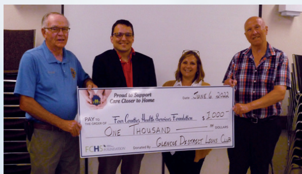
Glencoe District Lions Club - $1,000