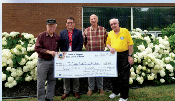
Kiwanis Club of West Lorne St Thomas Jackpot Bingo - $2,500