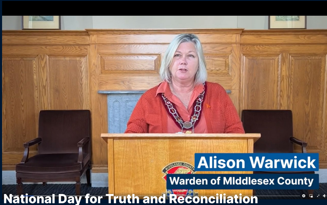
National Day for Truth and Reconciliation